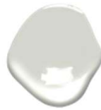
OC-52 GRAY OWL BODY