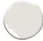
OC-26 SILVER SATIN TRIM