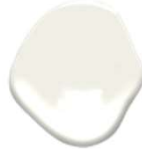
OC-17 WHITE DOVE TRIM