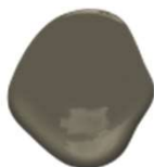
1491 AEGEAN OLIVE SHUTTER