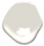
1464 LIGHT PEWTER BODY