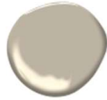
AF-100 PASHMINA BODY