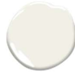
AF-15 STEAM BODY