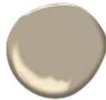
977 BRANDON BEIGE BODY