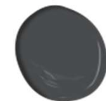
2124-10 WROUGHT IRON DOOR