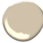
HC-80 BLEEKERS BEIGE TRIM