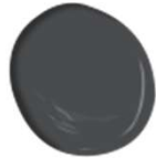
2124-10 WROUGHT IRON SHUTTERS