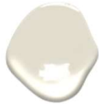
OC-24 WIND'S BREATH TRIM