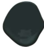
HC-187 BLACK FOREST GREEN DOOR