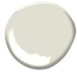
OC-50 NOVEMBER RAIN TRIM