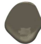
1491 AEGEAN OLIVE SHUTTERS