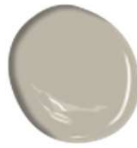
1536 NORTHERN CLIFFS BODY