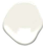
OC-17 WHITE DOVE