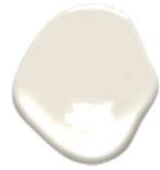
969 SOFT CHAMOIS TRIM