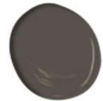
1547 DRAGON'S BREATH SHUTTERS