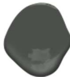
1582 DEEP RIVER DOOR