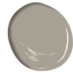
1552 RIVER REFLECTION SHUTTERS