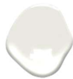
OC-25 CLOUD COVER TRIM