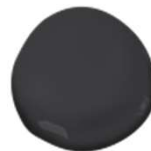
2133-20 BLACK JACK DOOR