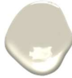
OC-48 HAZY SKIES TRIM