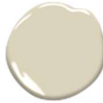
HC-81 MANCHESTER TAN BODY