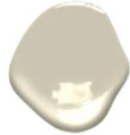
976 COSTAL FOG TRIM