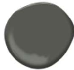
1484 ASHWOOD MOSS SHUTTERS