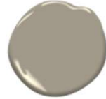
HC-175 BRIARWOOD BODY