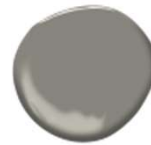
HC-168 CHELSEA GRAY SHUTTERS