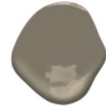
1546 GARGOYLE SHUTTERS