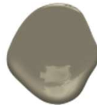
HC-100 GLOUCESTER SAGE SHUTTERS