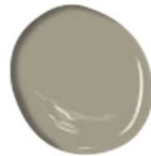
1537 RIVER GORGE GRAY BODY