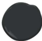
2131-10 BLACK SATIN DOOR