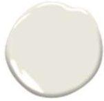
OC-18 DOVE WING TRIM