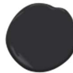
2132-10 BLACK DOOR