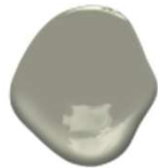
2140-40 STORM CLOUD GRAY DOOR