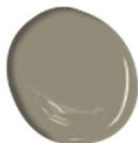
HC-104 COPLEY GRAY BODY