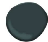
2050-10 SALAMANDER DOOR