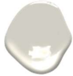
1534 RODEO BODY